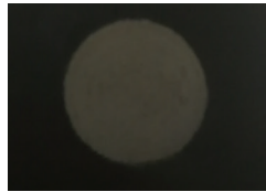
Beam profile of the amplified pulse