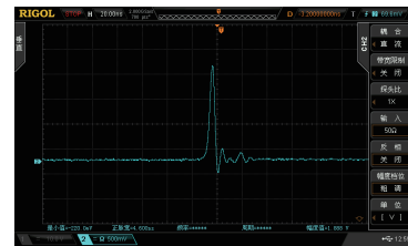
PIN signal and amplitude